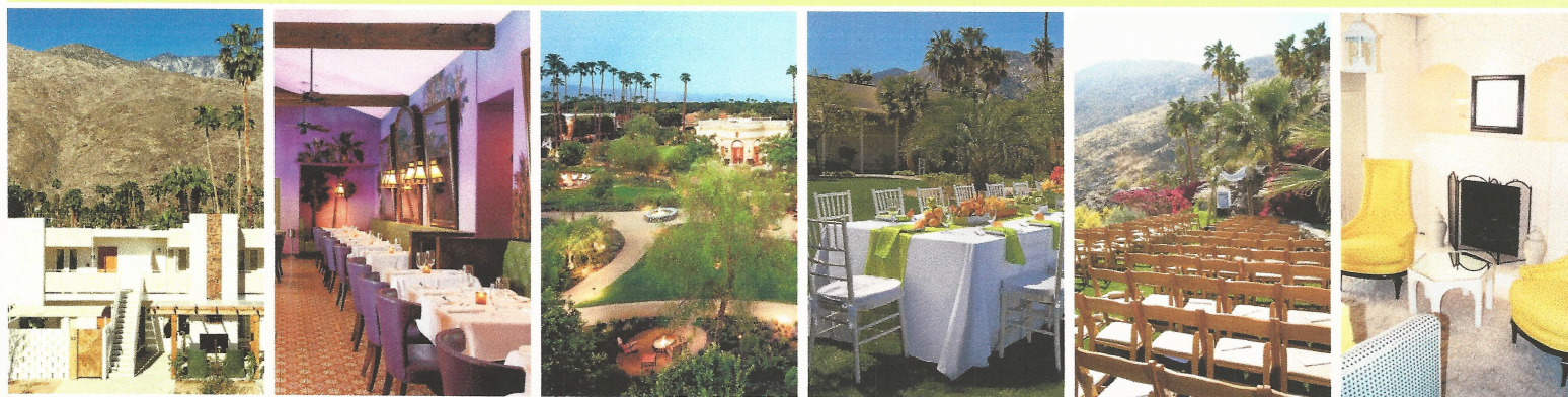
Photos from left to right: Ace Hotel, Colony Palms Hotel, Parker Palm Springs, Riviera Resort & Spa, The Willows Inn, Viceroy Palm Springs

We personally traveled to Palm Springs and toured, ate and slept at several wedding venues just so we could give you perfect desert destination wedding options and info. There's something for every couple, whether your bridal style is young and hip, elegance and antiques, midcentury modern, or Hollywood chic, so come on, let's find YOUR "desert destination I do" style!